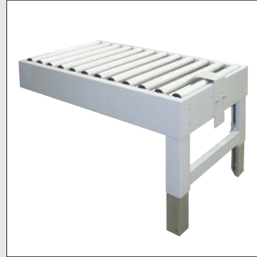
Long Infeed/Exit Conveyor w/ L-Bracket