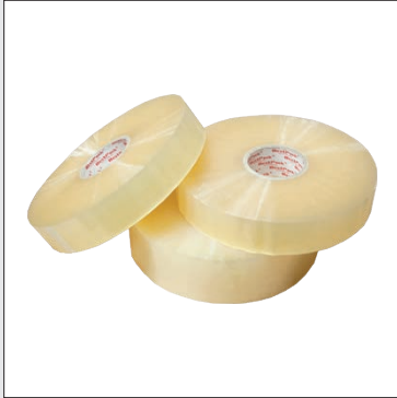
Carton Sealing Tape