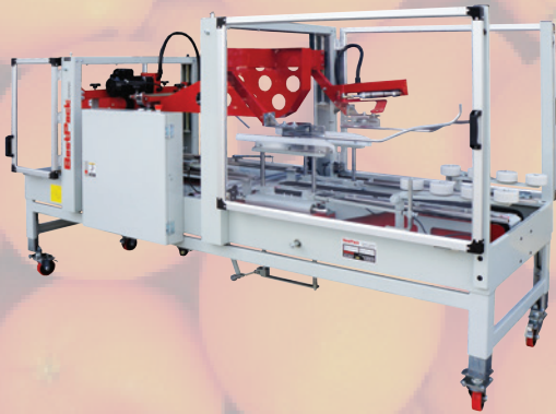
ATFXU Automatic Fruit Box Sealer