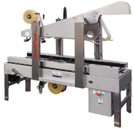
Interlock gates in the flap folding section are included but not shown in the above picture.

All BestPack stainless steel units are crafted with food grade 304 stainless steel for 21 CFR 110 compliance and available in splash resistant or wash down models. The AS-S also includes our exclusive stainless steel 2" or 3" pop-out pressure-sensitive "High Speed" tape heads with BestPack's patented tab adjustment.