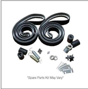
Spare Parts Kit