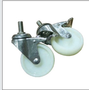
Stainless Steel Locking Casters