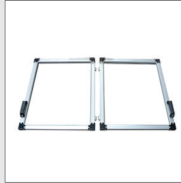
Custom Interlock Gates (Special Order)