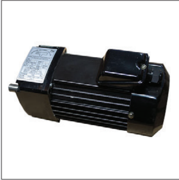
High Speed Motor Upgrade (Up to 125 ft. per min.)