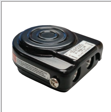
Air Activated Foot Pedal