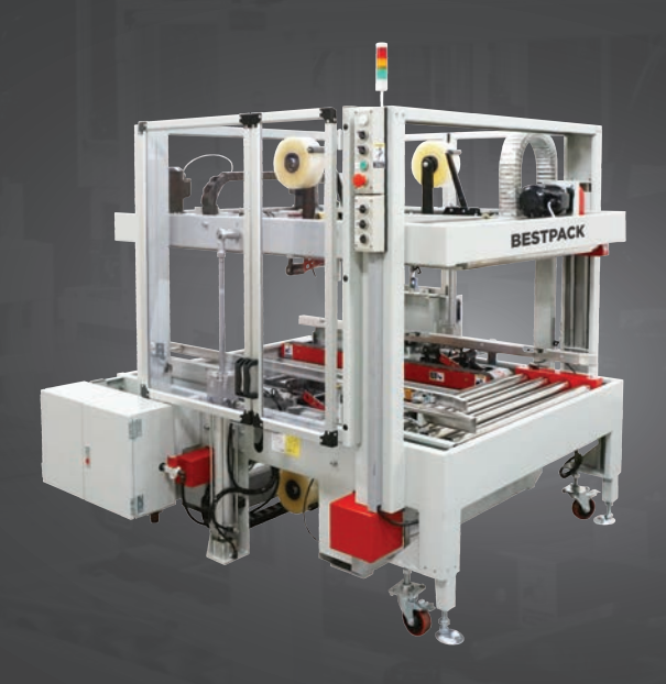
Note: Unit shown with front right side infeed, also available with a front left side infeed at additional cost.