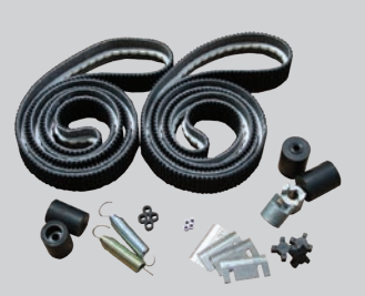
SPARE PARTS KIT "Spare Parts Kits may vary based on machine" Minimize downtime with BestPack's Spare Parts Kit.

Order a spare tape head with your machine to minimize down time. Having a spare will allow you to drop in a tape head with a new roll of tape in no time!