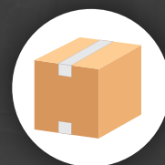
TOP & BOTTOM SEAL