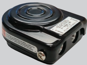
AIR ACTIVATED FOOT PEDAL This foot pedal allows the user to determine whether air will flow through the machine or not.

Please refer to comparison chart for complete list of models.