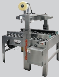
FOOD GRADE 304 STAINLESS STEEL This machine is available in 304 stainless steel which is food grade safe for food applications.