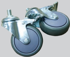
LOCKING CASTERS The heavy duty locking casters allow the carton sealer quick and easy mobility to other locations.