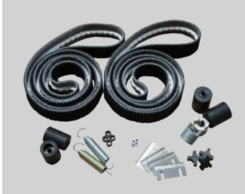
SPARE PARTS KIT "Spare Parts Kits may vary based on machine" Minimize downtime with BestPack's Spare Parts Kit.