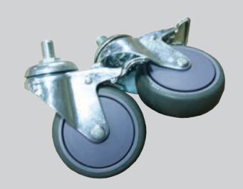
LOCKING CASTERS The heavy duty locking casters allow the carton sealer quick and easy mobility to other locations.