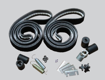
SPARE PARTS KIT "Spare Parts Kits may vary based on machine" Minimize downtime with BestPack's Spare Parts Kit.

This 19.75" short or 39.5" long conveyor is a great work platform and allows for staging of cartons on the infeed and the exit.