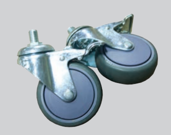
LOCKING CASTERS The heavy duty locking casters allow the carton sealer quick and easy mobility to other locations.