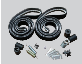
SPARE PARTS KIT "Spare Parts Kits may vary based on machine" Minimize downtime with BestPack's Spare Parts Kit.