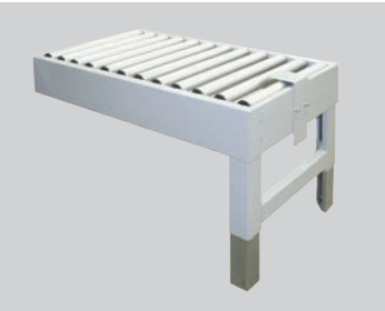
LONG INFEED/EXIT CONVEYOR W/ L-BRACKET STABILIZER

This 39.5" long conveyor is a great work platform and allows for staging of cartons on the infeed and the exit.