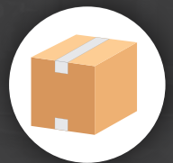
TOP & BOTTOM SEAL