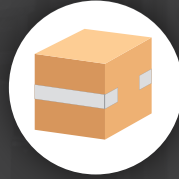
TOP & BOTTOM SEAL