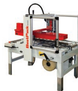
MT1E Manual Top & Bottom Drive One Edge