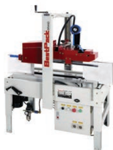
MS1E Manual Sidedrive One Edge