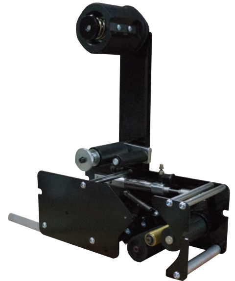
Shown above is the BestPack PT High Speed Tape Head

The High Speed PT Tape Head is available in 2" when used for edge sealing and available in 2" and 3" when used for center sealing without front of back tab leg. This tape head is also available in food grade 304 stainless steel for 21 CFR 110 compliance.