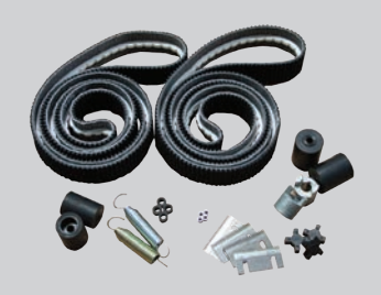
SPARE PARTS KIT *Spare Parts Kits may vary based on machine* Minimize downtime with BestPack's Spare Parts Kit.

This 19.75" short conveyor is a great work platform and allows for staging of cartons on the infeed and the exit.