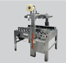
FOOD GRADE 304 STAINLESS STEEL This machine is available in 304 stainless steel which is food grade safe for food applications.