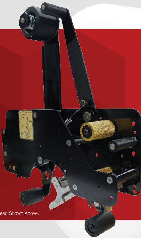
BP Tape Head Shown Above.