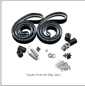
*Spare Parts Kit May Vary*