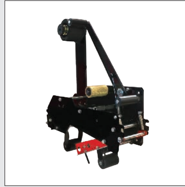
Spare Tape Head