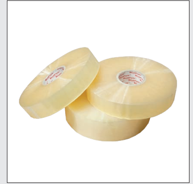
Carton Sealing Tape