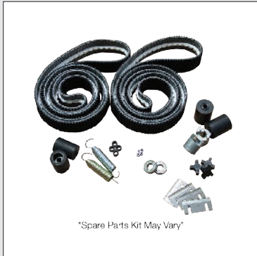
Spare Parts Kit