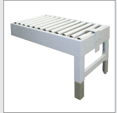
Long Exit Conveyor w/ L-Bracket