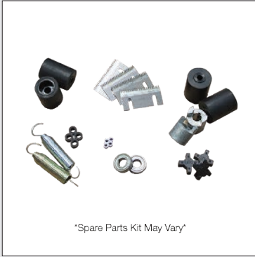
Spare Parts Kit