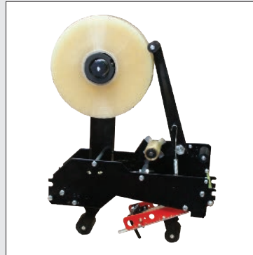
Spare Tape Head