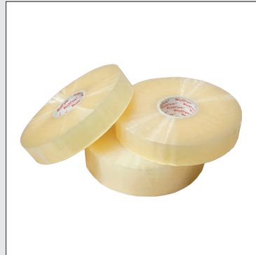
Carton Sealing Tape