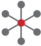
Universal Narrow Design