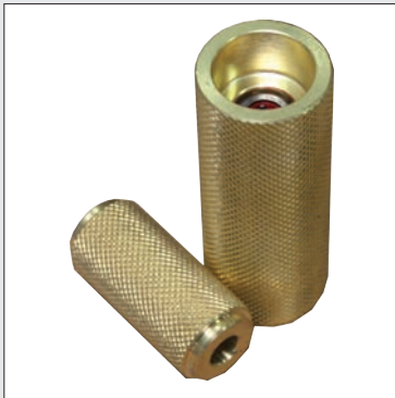
Knurled Brass Rollers