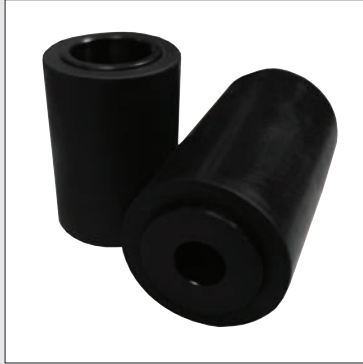
Rubber Roller Front/Rear