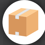
TOP & BOTTOM SEAL