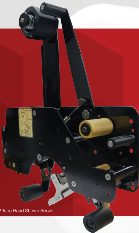
BP Tape Head Shown Above.