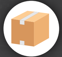
TOP & BOTTOM SEAL