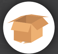
BOTTOM FLAP FOLDER