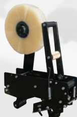
Made for the ATFXU Sealer TH TAPE HEAD