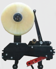
BestPack Standard AC TAPE HEAD