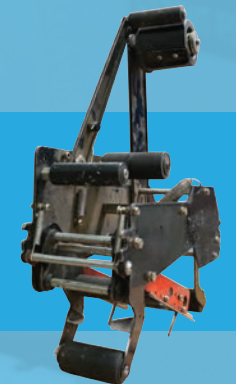
AC Tape Head Shown