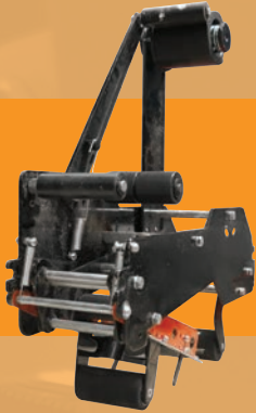
AC Tape Head Shown

Not sure what tier you're in? Take a look at our Tier Guide below and find out.