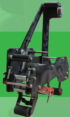
AC Tape Head Shown