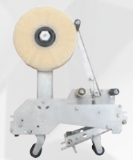
BestPack Stainless AC TAPE HEAD

*Pricing may vary depending on tape head model.