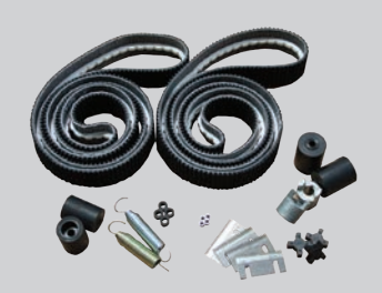
SPARE PARTS KIT *Spare Parts Kits may vary based on machine* Minimize downtime with BestPack's Spare Parts Kit.