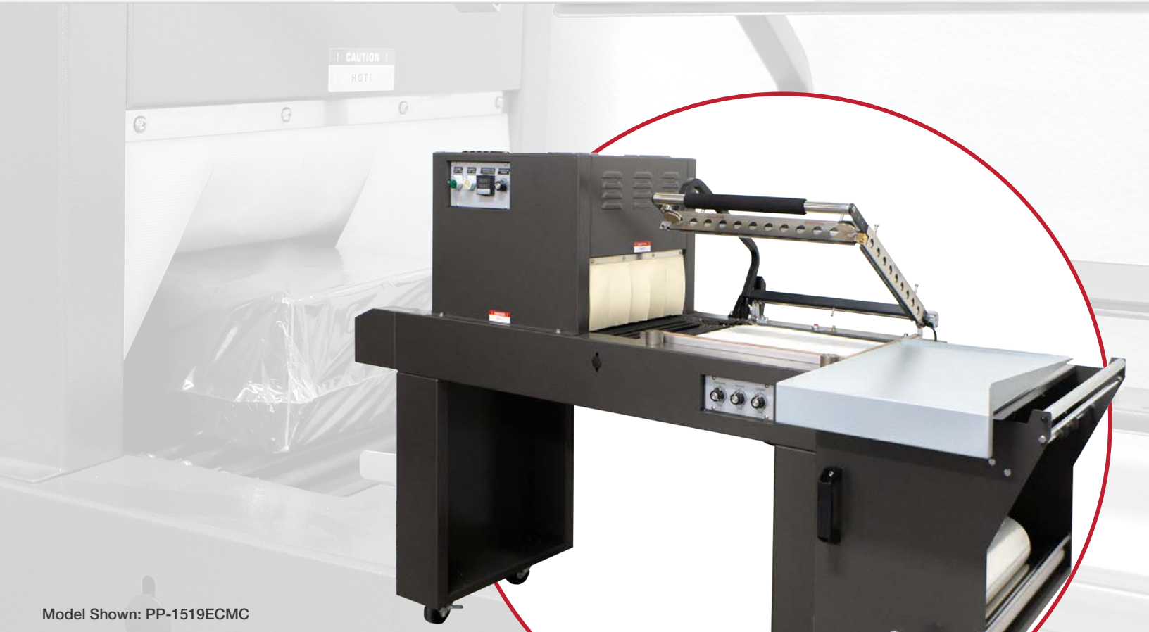
Model Shown: PP-1519ECMC