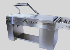
PP-1622MK-SS Stainless Steel Frame Construction.