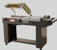
PP-1622HK Hot Knife Seal System Used with Polyethylene Films.