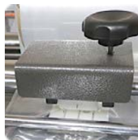
Pinwheel Hole Punch