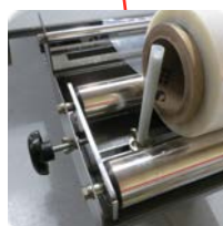
20" Film Cradle with Roll Brake and Roll Guide

The Preferred Pack Model PP-1622HK is a proven workhorse with thousands of machines in the field successfully running since 1993. Our 20 plus years of experience as the industry leader in manufacturing semi and fully automatic L'Sealers will give you the peace of mind knowing you have purchased the best machine available on the market today!