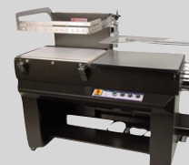
PP-1622MKA-V-PI Air Operated with Vertical Seal Head, Power Film Unwind and Adjustable Film Inverting Head.