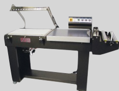
PP-1622MK-A Air Operated Seal Head.