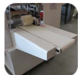
24" Long Discharge Conveyor