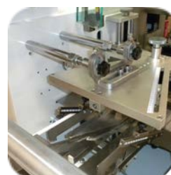
Adjustable Forming Box