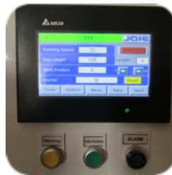
7" Color Touch-Screen HMI w/ 50 Program Memory