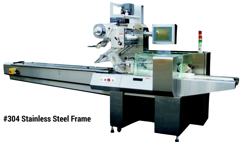
#304 Stainless Steel Frame