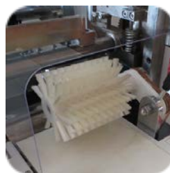
Discharge Brush Helps Separate Products