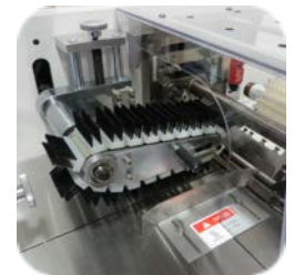
Upper Brush Pushes Air Out of the Bag