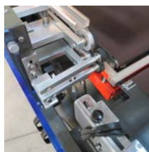
Film Miser - helps track film allowing for smaller width film rolls to save money