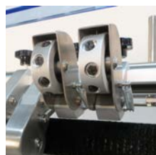
Pin Wheel Hole Punch