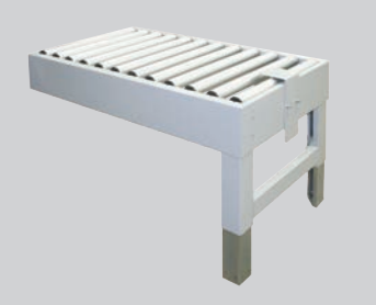
SHORT OR LONG INFEED/EXIT Conveyor W/ L-bracket stabilizer

This 19.75" short or 39.5" long conveyor is a great work platform and allows for staging of cartons on the infeed and the exit.