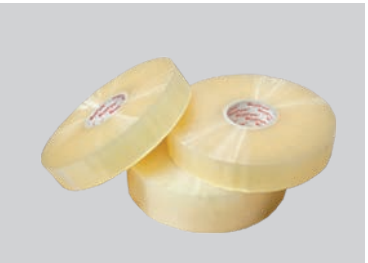
CARTON SEALING TAPE Put high quality tape on your BestPack Carton Sealer. Make sure to order machine length rolls for your new carton sealer.