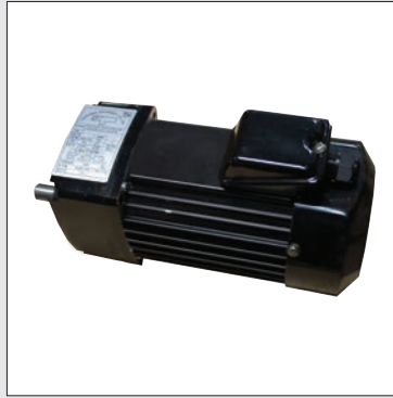
High Speed Motor Upgrade (Up to 100 ft. per min.)