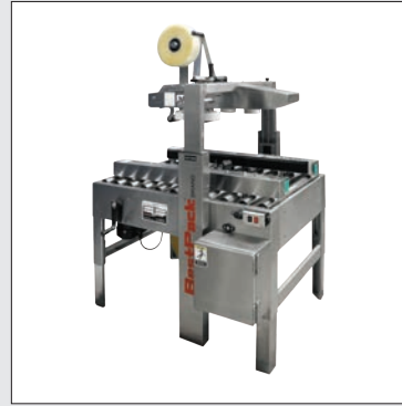
304 Stainless Steel Manual Sidedrive