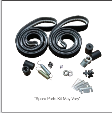
Spare Parts Kit